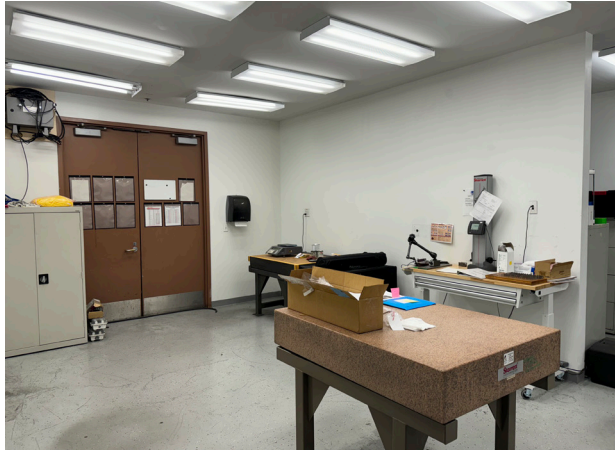
Shop Space/Office Area