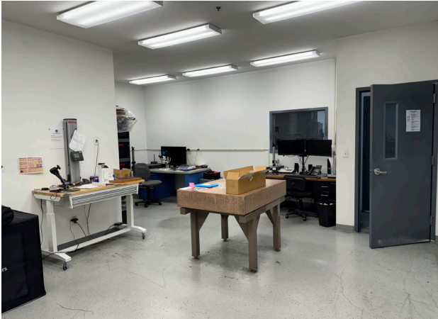
Shop Space/Office Area