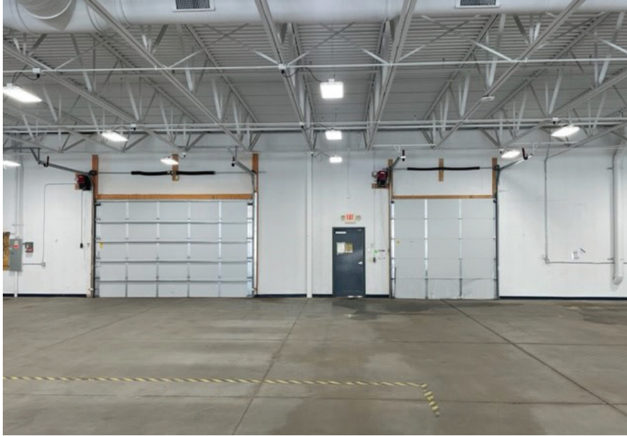
Two drive-in doors